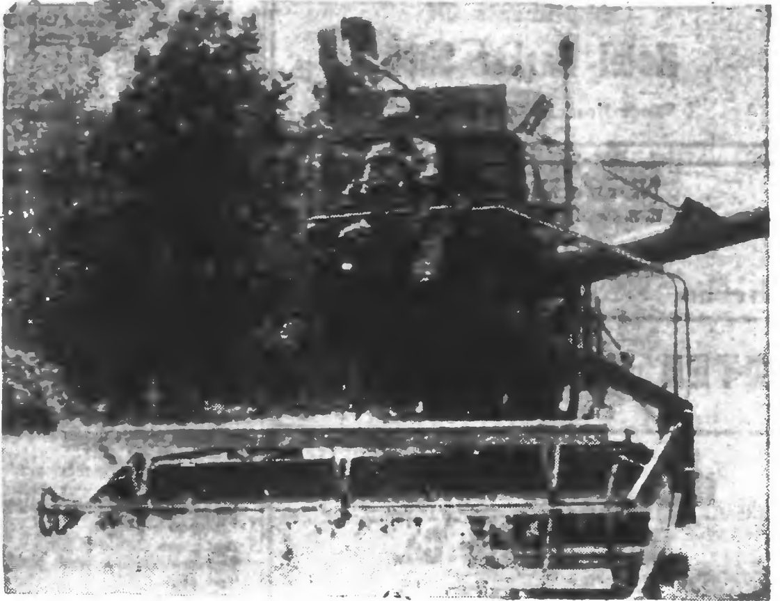
DURING THE EARLY SUMMER combines are active throughout the county grains planted by Hoke farmers. Then in the fall the same combines are busy again harvesting wheat, oats, barley and other harvesting soy beans.

(These foods should be shown in pint or half-pint standard Mason jars-not commercial jars.) Best peach preserves Best pear preserves Best fig preserves Best strawberry preserves Best watermelon rind preserves Best apple preserves