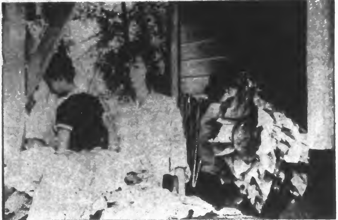
BARNING TOBACCO still takes a great deal of hand labor to get the job done and even though automatic curers have taken the place of wood stokers in most barns throughout the area, there's still a great deal of care needed to insure the curing of leaf that will bring the high price on Border Belt markets.

Long-time supporters of the 4-H tractor program are American Oil, Standard Oil Foundation (Chicago), Standard Oil (Kentucky), Standard Oil (Ohio), Utah Oil Refining, and more recently, Humble Oil Refining.