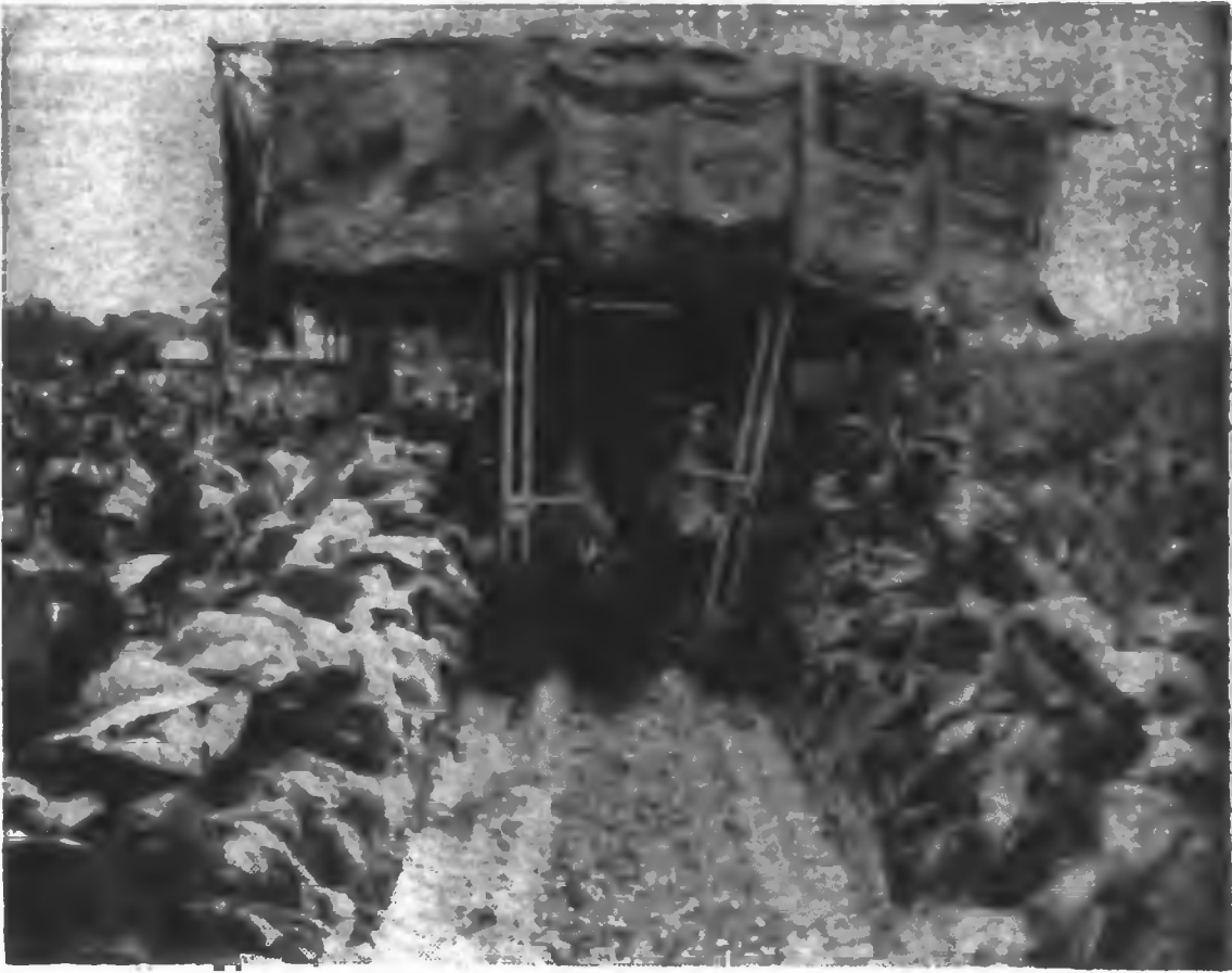
TOBACCO STILL RANKS TOPS in the county and mechanization is taking some of the burdensome work out of the harvesting of the product. Just such a harvester is shown wending its way down a row in one of the county's numerous tobacco fields. The pickers are seated through the operation and the tobacco comes to the picker instead of the reverse as in days past.

WESTERN AUTO ASSOCIATE STORE Main St.—Raeford Phone 875-2061 Come by and take advantage of our Christmas Lay-A-Way on a complete line of Toys and Wheel Goods—