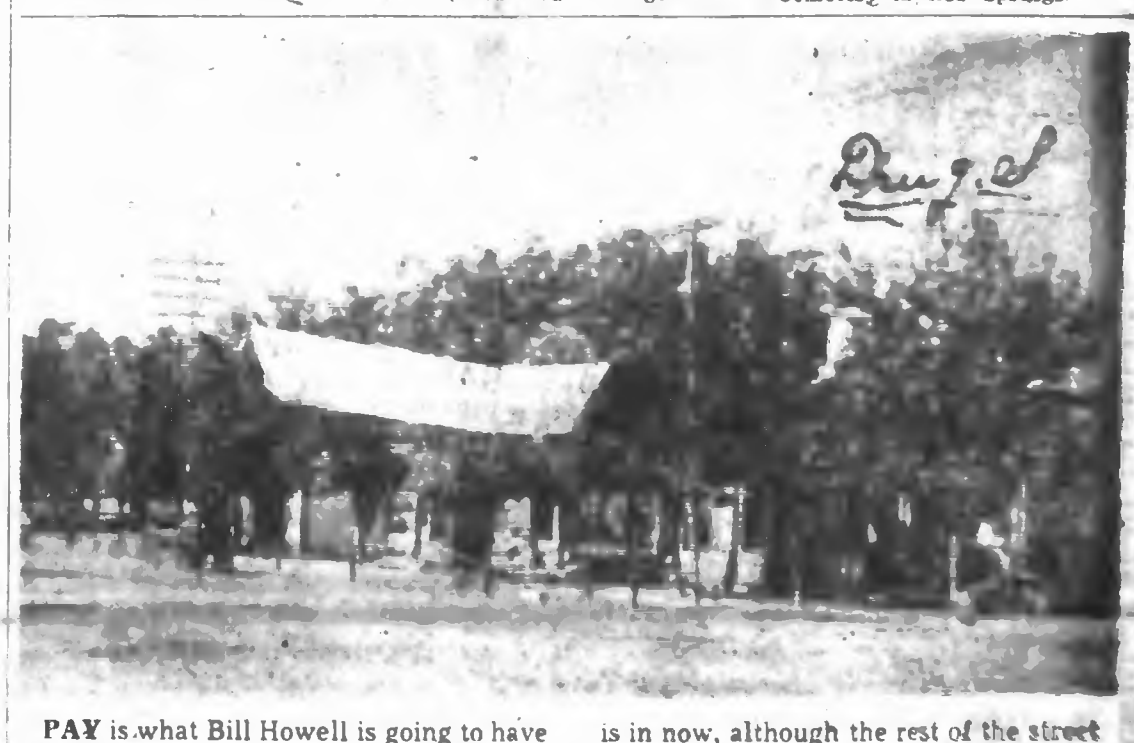
PAY is what Bill Howell is going to have to do for the next advertising he gets, but this picture in 1908 shows the same building the drug store is in now, although the rest of the street and the surrounds seem to have changed a mite.

Funeral 10:00 Today Funeral service is to be conducted at 10:00 o'clock this morning at Red Springs Presbyterian church for Knox Watson, Jr., and burial is to be in Alloway Cemetery in Red Springs.