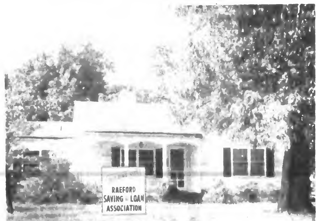
SITE - The building site for the new Rasford Savings and Loan Association is at 113 Campus St. This dwelling house will be moved away to make room for the new building.

The trip home will start at 9 o'clock Saturday morning, and the battalion will spend the night near Santee, S. C. After an early start Sunday, the Raeford-Red Springs inits are expected to reach their home armorys by about 10 o'clock. After about two hours of caring for their equipment and vehicles dismissal from 1963 Summer (See GUARDSMEN. Fg. 12)