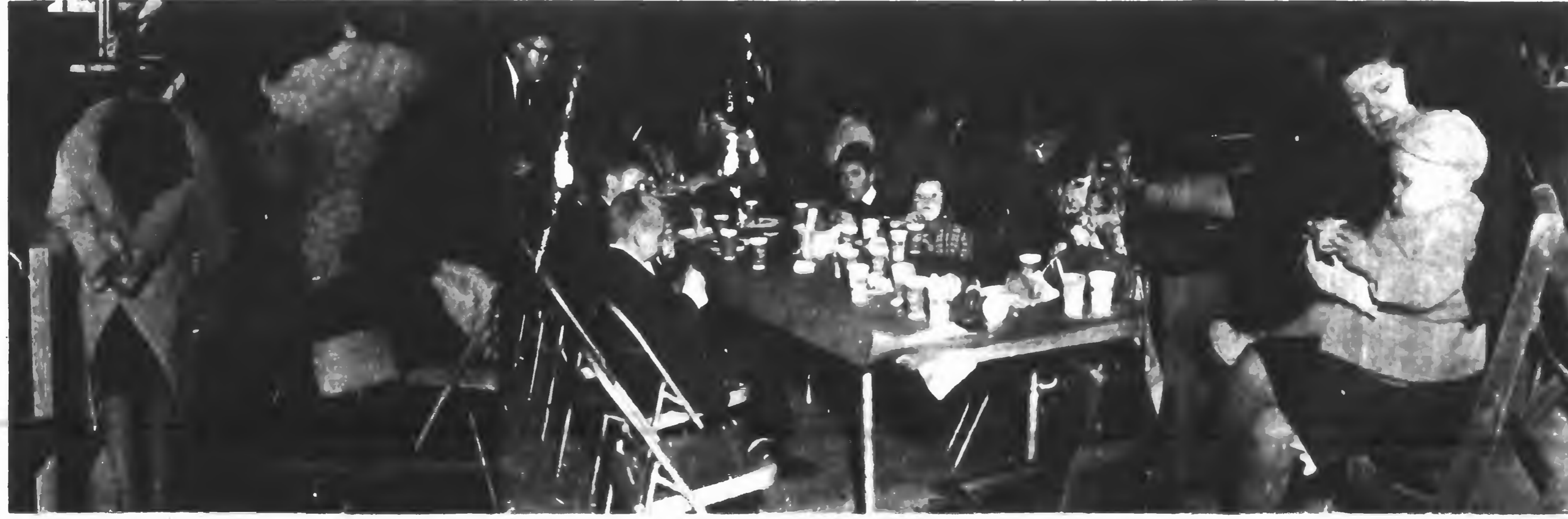
CHRISTMAS PARTY -- several hundred youngsters and their parents turned out last Sunday afternoon for the annual Christmas Party of Raeford Worsted Plant. Each child