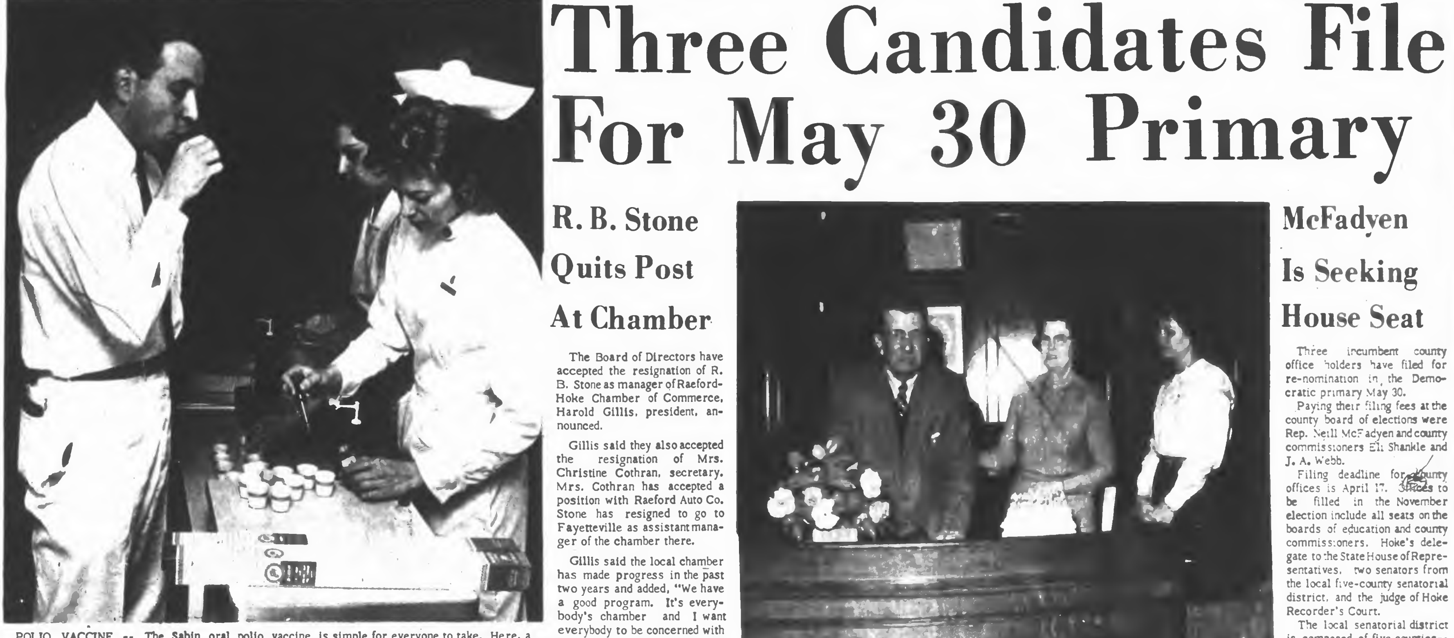
POLIO VACCINE -- The Sabin oral polio vaccine is simple for everyone to take. Here, a physician is shown taking his dose of the vaccine before administering it to residents of his community. Sabin vaccine will be administered throughout Hoke County March 27 under sponsorship of Raeford Jaycees. Five sites have been selected for the clinics.

The Hoke County Journal - Established 1905