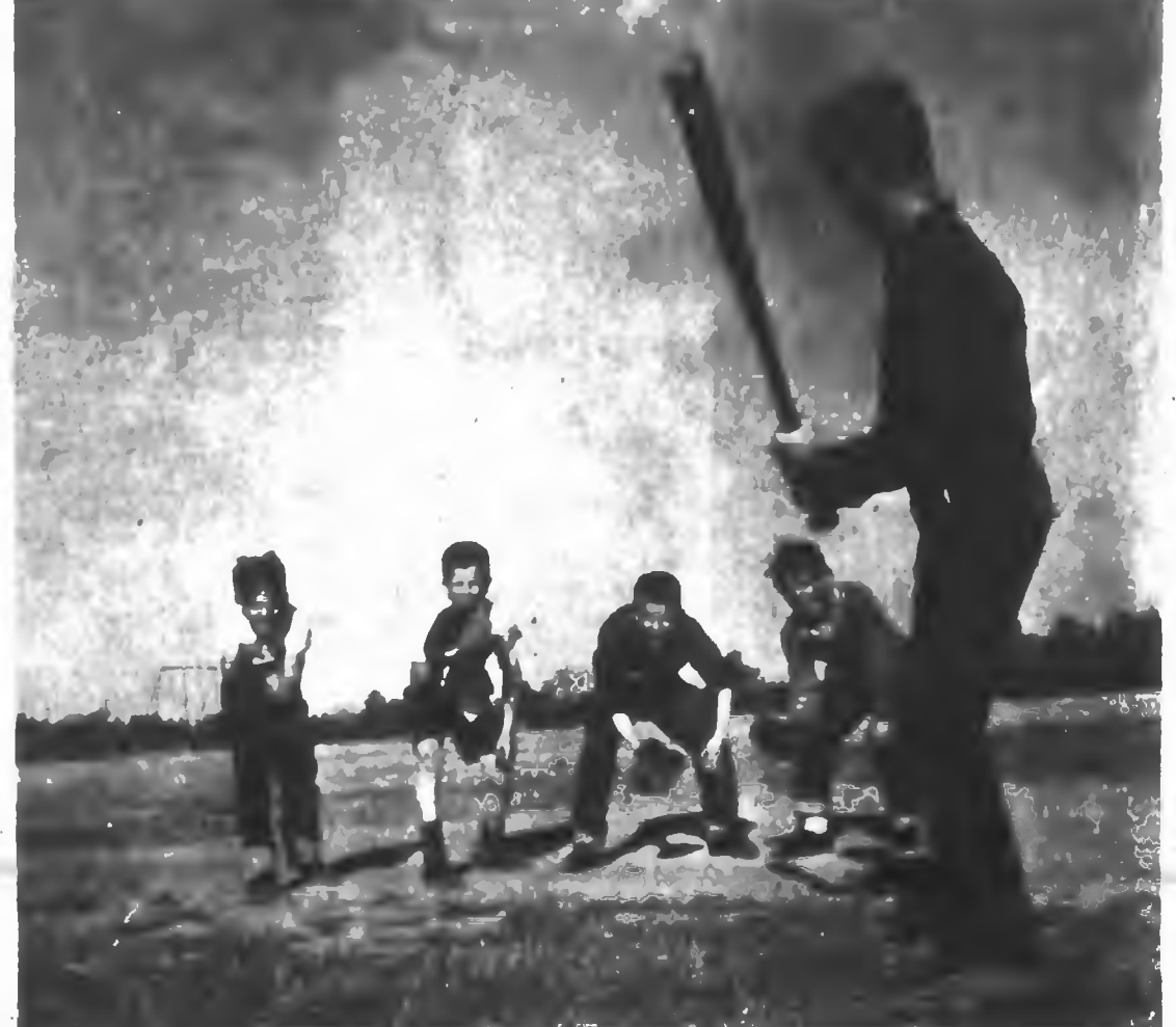
SPRING ARRIVES -- Although the calendar indicates it's almost two weeks away, spring seems ' to have arrived in Hoke County, where flowers are blooming, birds are singing, and gardeners are setting out spring vegetables. Nothing is more indicative of the welcome season than the appearance of baseballs and gloves, as with these youngsters shown Tuesday afternoon engaged in a game of pepper on the playground at Robbin Heights.