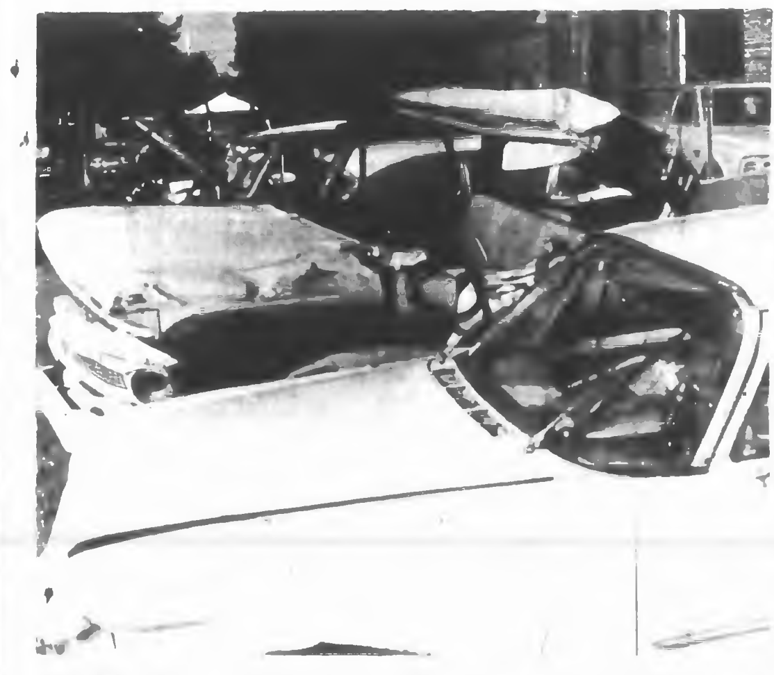
WRECKED PICKUP--J.H. McAnulty, Raeford welding shop operator, and Mrs. McAnulty were in the pickup truck, just behind the car in the foreground, when it rammed a loaded tractortrailer Monday afternoon near the turkey processing plant. The truck was coming up the grade on Highway 20 just south of the armory, officers said, and the McAnulty pickup hit it from behind and wedged under it.