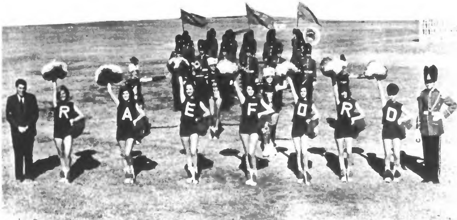
Letter Girls Spell Out R-A-E-F-O-R-D In Front Of Hoke High School's Prize-Winning Band