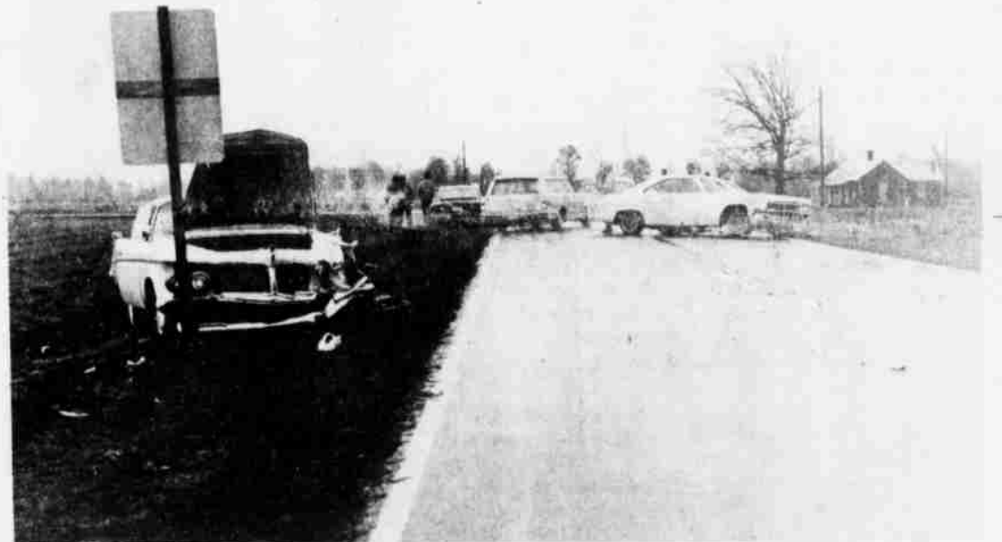
Wrecked Cars Block N.C. 20 South Of Town