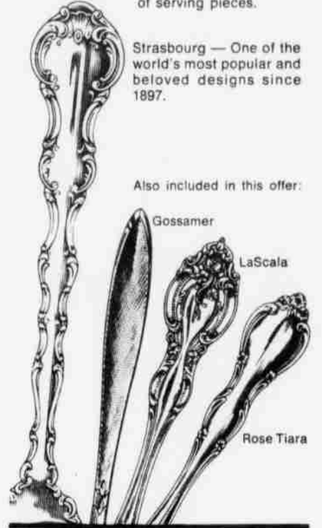
Strasbourg — One of the world's most popular and beloved designs since 1897.

Save 20% on any purchase... from a single teaspoon to a complete service for twelve. This offer also includes a magnificent array of serving pieces.