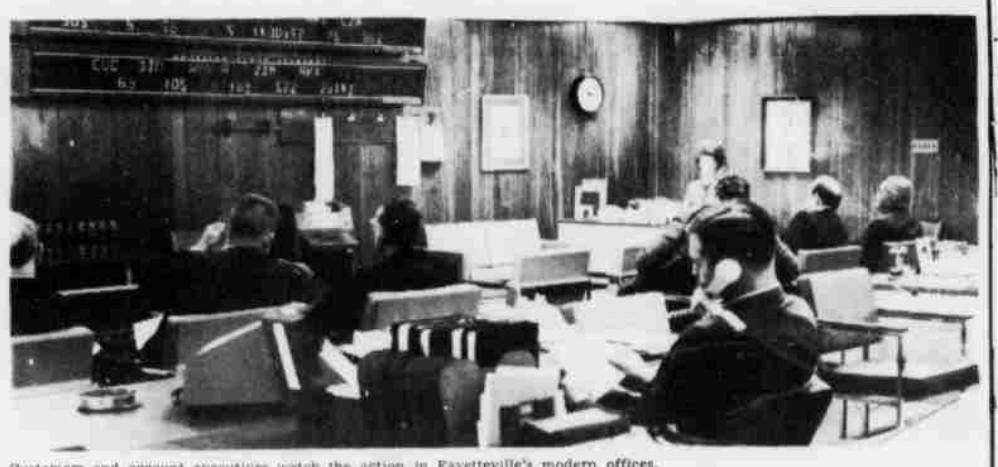
Customers and account executives watch the action in Fayetteville's modern offices.