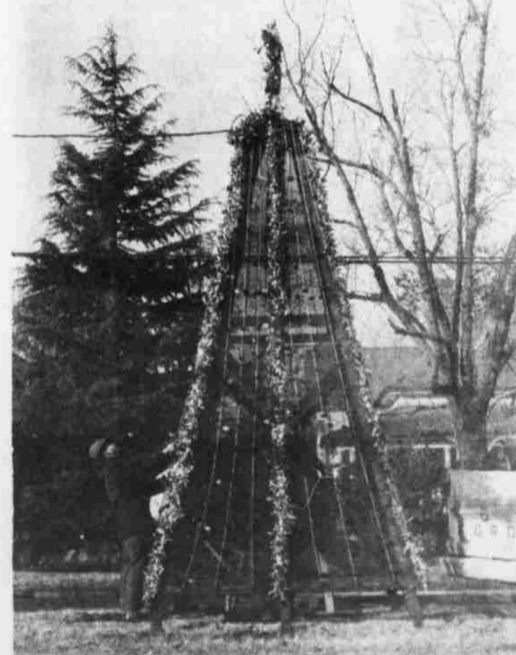
CHILDREN'S EMPTY STOCKING CHRISTMAS TREE FUND - The Raeford-Hoke Chamber of Commerce will use the proceeds to help needy families in the community have a better Christmas. It only costs $2 to light a bulb and to help the needy. The money to light a bulb can be sent or dropped by the Chamber of Commerce office on Edinborough Avenue.

The public is cordially invited to these Christmas programs.