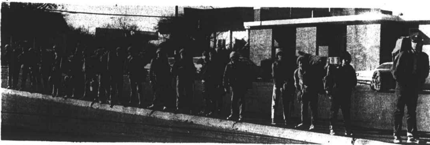
LOADED -- The Boy Scouts of Troop 401 get ready for an overnight backpacking trip week-end before last. The boys had to carry everything they would use so one resourceful Scout brought along his little red wagon for the three mile hike to the campsite.