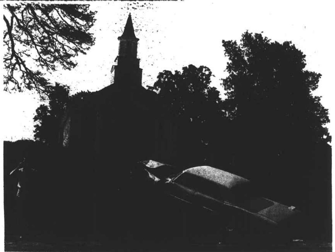
WRECK AT ANTIOCH - Five persons were injured in the crash at Antioch Church when the car driven by Lewis Roper of White Plains, N.Y. (top) struck the car of Cary Junios McQueen (bottom). Two passengers in the Roper car were admitted to Moore Memorial Hospital, with one in critical condition. McQueen was also admitted in satisfactory condition. Roper and another passenger were treated and released. Roper is charged with failure to yelld right of way at a stop sign and is under $300 bond.