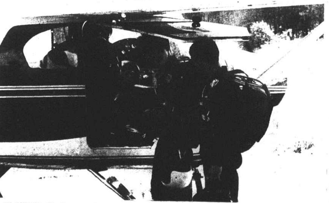
ALL ABOARD -- Sky divers get ready for take off at the airport. Members of a sport parachute club make jumps there on weekends and frequently during the week. The city has just completed a small office building at the airport and has leased for the sky diving activities.