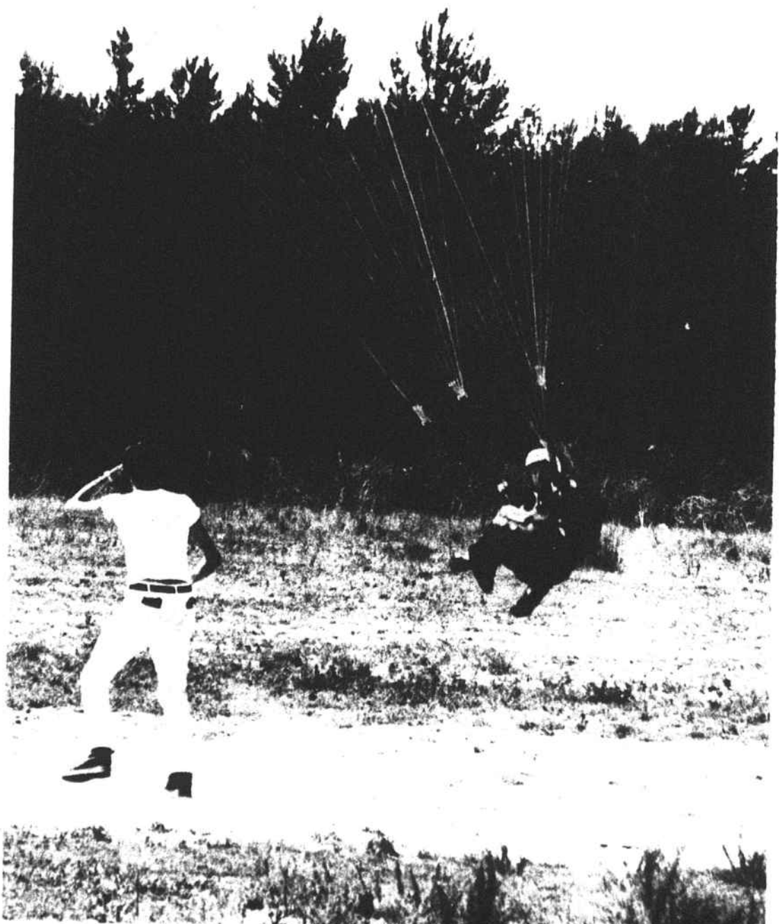
TOUCHDOWN -- A member of the Green Beret Sport Parachute Club comes in for a landing at the target area at the Raeford airport last week. The parachutist make frequent jumps there during the week.