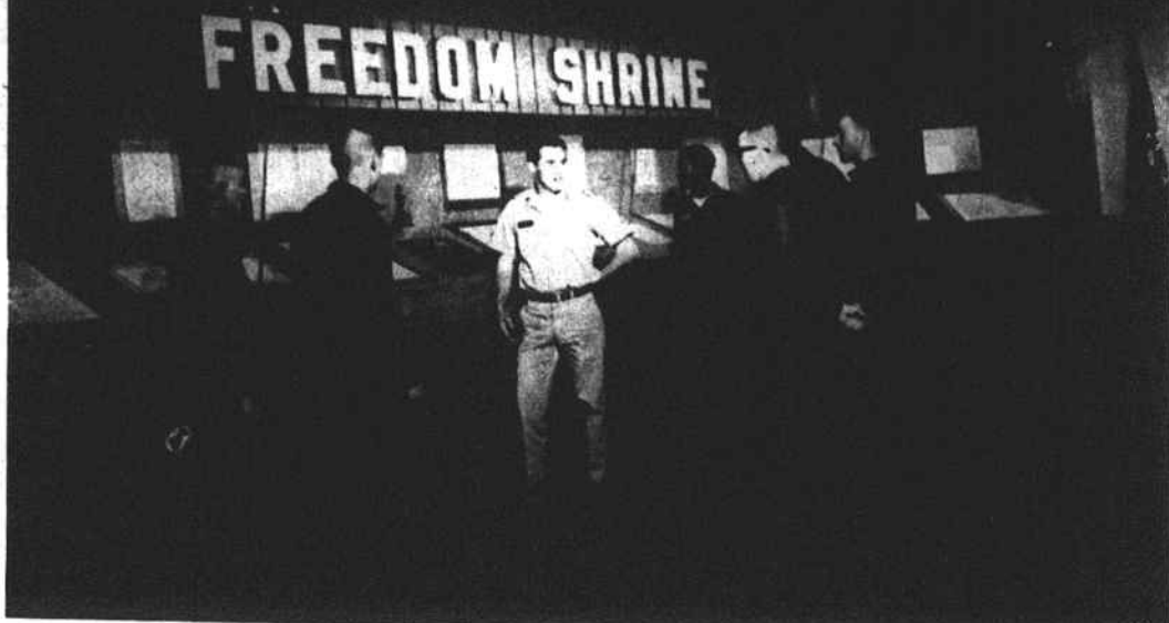
"VIP" TOUR—A khaki-clad member of the Ft. Lewis Reception Station discusses American heritage with six new soldiers on a "VIP" tour of the station's Freedom Shrine in Freedom Hall. The displays are designed to remind the new

recruit of his heritage, the part the U.S. Army has played in the colorful history and development of our nation, as well as how important it is to pause and reflect on our hard-earned freedoms.