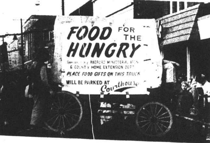
HELPING HAND - A food truck for families in need this Christmas was sponsored by the Raeford Ministerial Association and the County Home Extension Department.