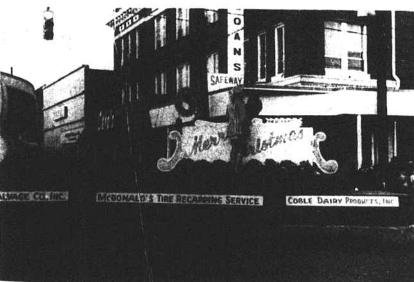
HOLIDAY GREETINGS - Pretty girls bring a Yuletide message to those at the parade.