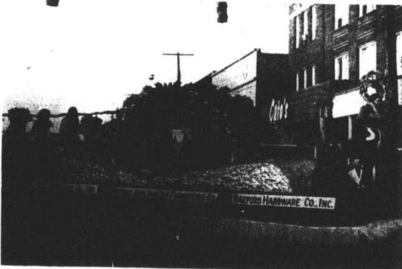
CHRISTMAS CHEER - Candles and holly make the holidays bright in this Christmas parade greeting.