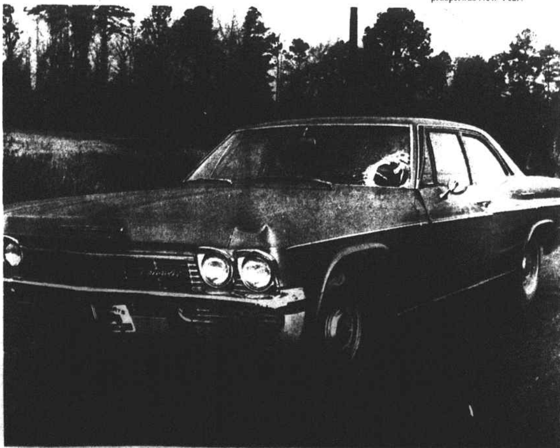
PEDESTRIAN DIES - A pedestrian walking near Upchurch School last Friday morning was struck and killed by this car.

Carolina Telephone MEMBER OF THE UNITED TELEPHONE SYSTEM