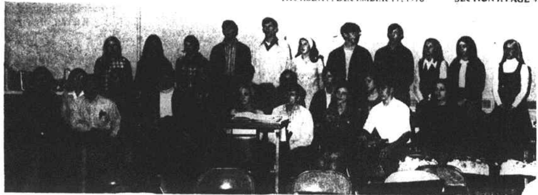
SONGSTERS - The Hoke High chorale rehearses for the chorus and choral Christmas concert.

Eulalia Cook (Costa Rica) Copyright--THE UPPER ROOM