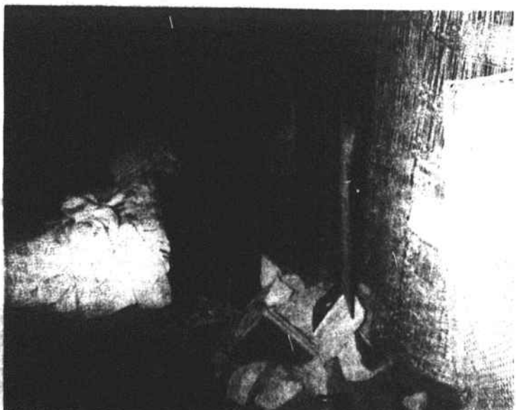
SAFE CRACKED -- The door of this small safe at Lipscomb's Grocery Store on Harris Avenue was torn off and an undisclosed amount of change stolen in a break-in at the grocery Sunday night.