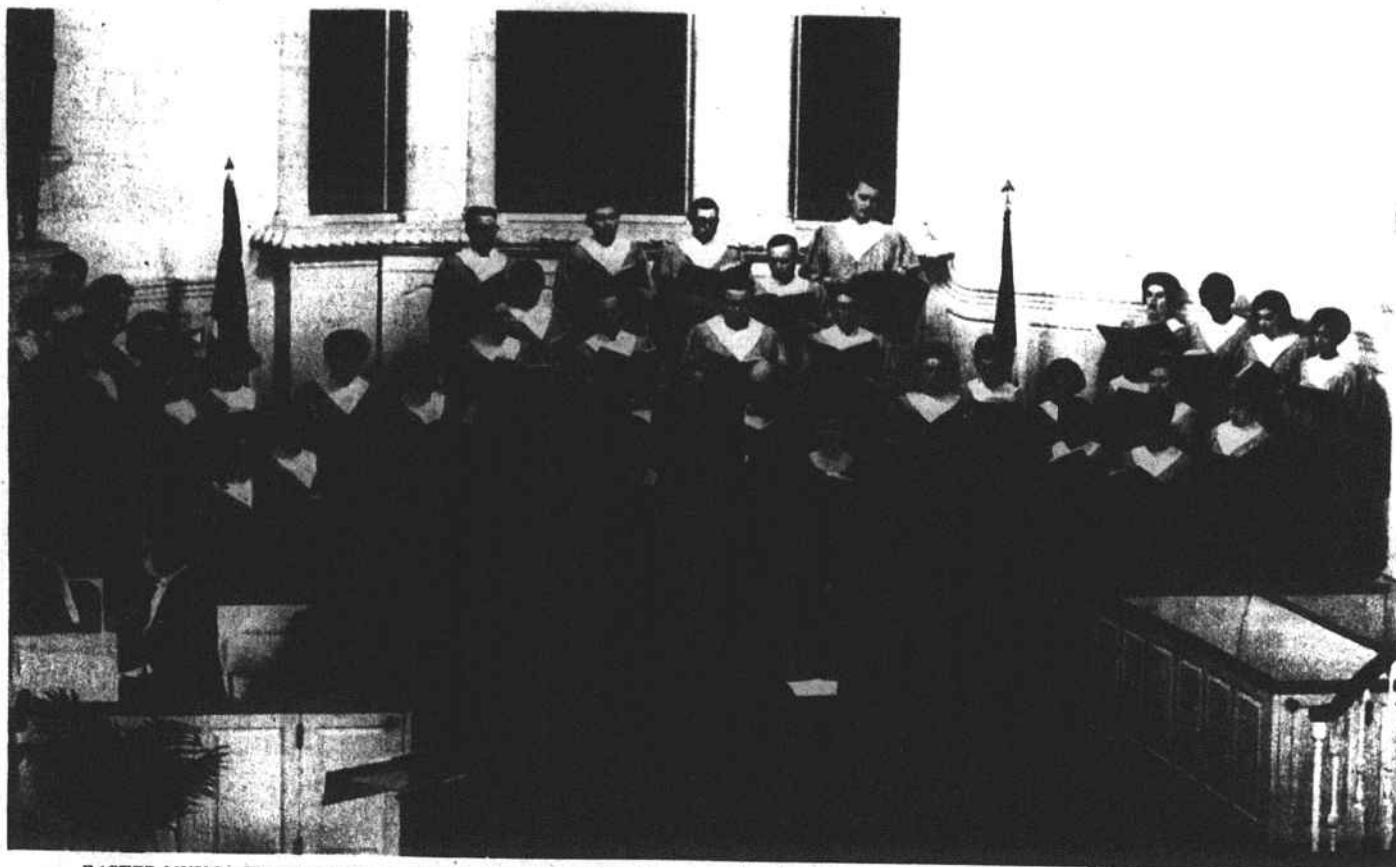
EASTER MUSIC-- The Chapel Chorus of Ft. Bragg presents "The Seven Last Words" by Haydn in a program at the Raeford Presbyterian Church Friday.