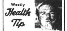
By Mike Wood, Reg. Ph.

Hoke County farmers are urged to take a look at their need for grain storage and drying equipment, and then visit their county ASCS office to discuss the details of the program.