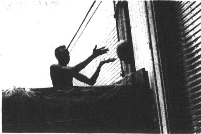
LOADING -- Harvesters load watermelons on the Crouch farm in the Five Points area this week.