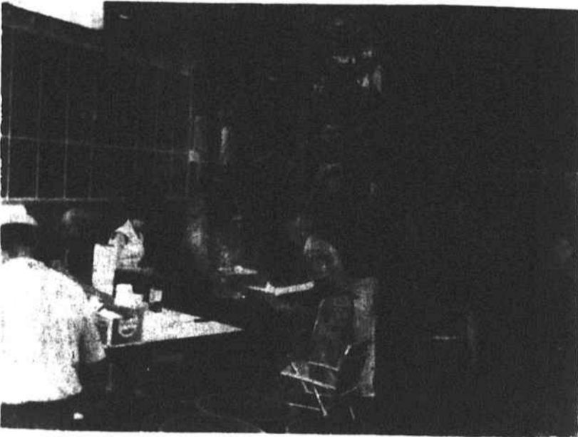
SUPPER TIME - Guests and golfers enjoy steak at the close of the first day of play in the Arabia tournament last weekend.