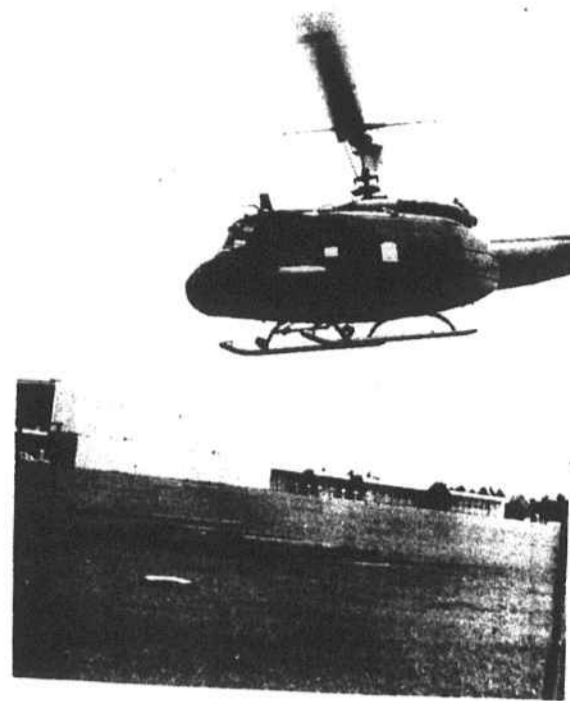
COMING DOWN - One of the nine helicopters bringing the guests to the county lands on the athletic field behind Hoke High Tuesday.