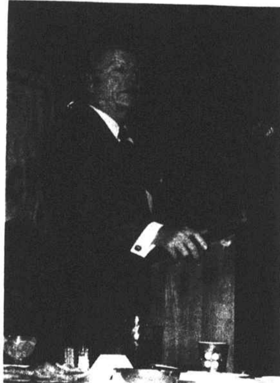
A FEW WORDS - Rep. Alton Lennon spoke briefly at the luncheon hosted by the Chamber of Commerce. Programs such as the Army is doing in Hoke County would do much to erase the poor image of the military, he said.