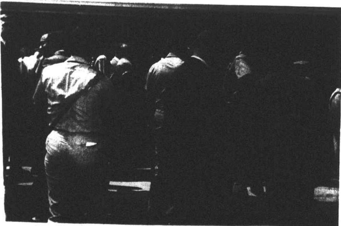
MINGLING - Pentagon and Army visitors chat with county residents over sherry at the Raeford Civic Center before the luncheon given by the Raeford-Hoke Chamber of Commerce.