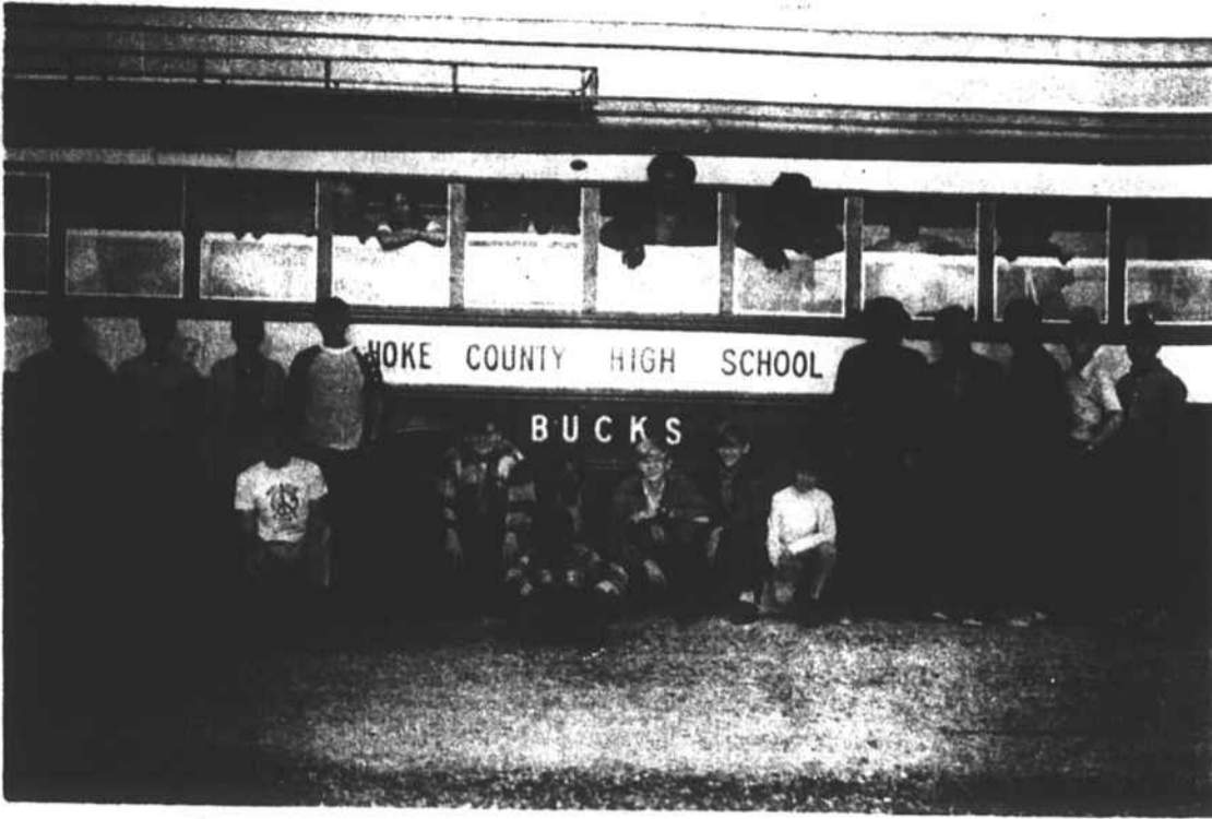
BUCKS BOWLERS - The Hoke junior bowling league pose outside their bus before going to Fayetteville for Saturday league play. The new activity has 50 keglers.