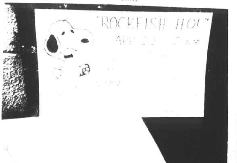
ROCKFISH HO - Sign says 'all to come and help clean up the Rockfish Creek swimming hole as part of a Girl Scout project to help clean up Hoke County. Signs like this have been placed in all of the county schools and the downtown areas.

Previews has received wide acclaim from educators and civic organizations for its ability in encouraging more student interest in technical career opportunities.