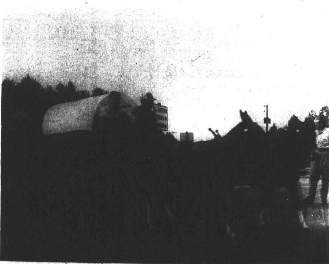
ON THE MOVE - The wagon train left Raeford Friday morning and returned Sunday after a stay at Sinclair Pond.