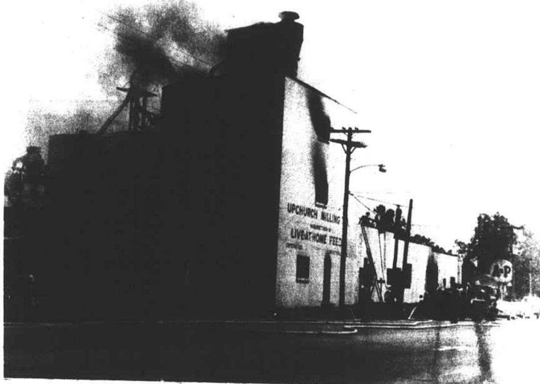
SECOND BLAZE - Volunteer firemen help control flames during the second flare-up of the glue flour mill section of the Upchurch Milling Co. Tuesday afternoon.

Dixon feels that at least a couple hundred more Hoke families are eligible for the stamps. "We're not reaching everyone that we can right now. Many