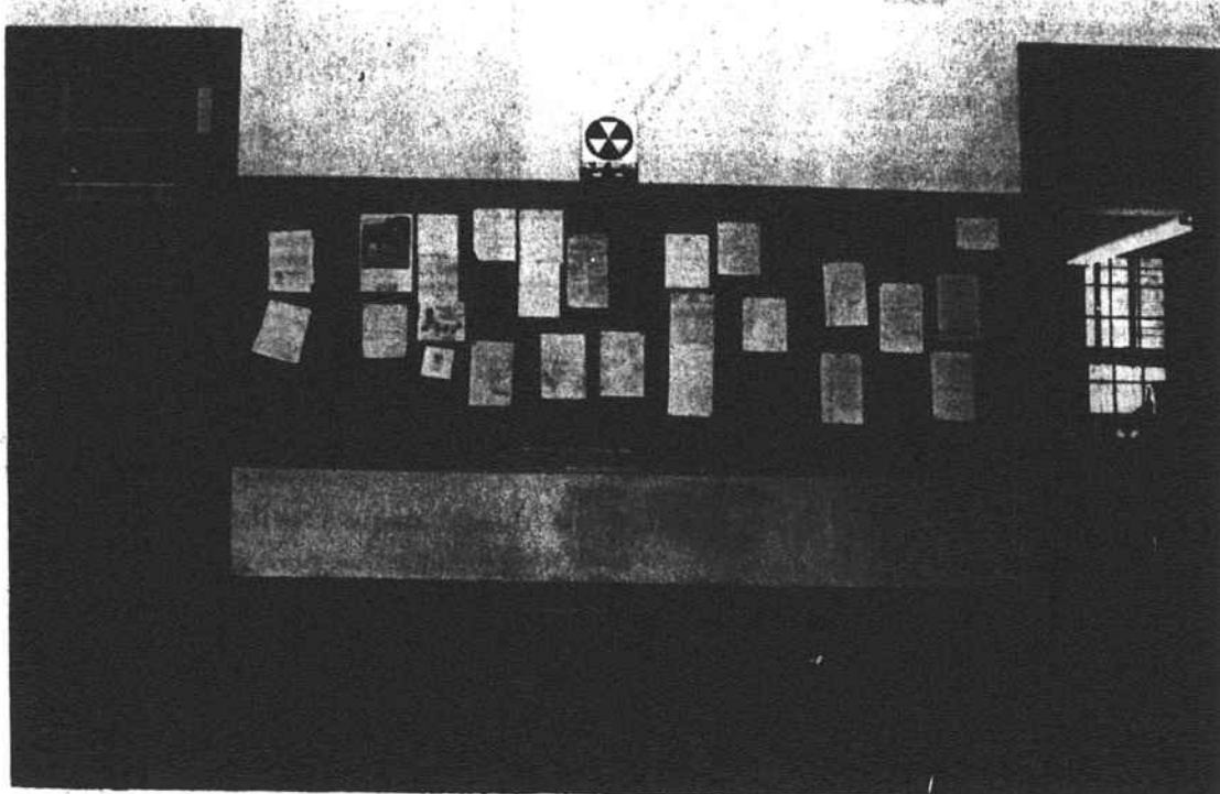
COURTHOUSE BULLETIN BOARD - Notice announcing special meetings of the board of county commissioners will be posted on this bulletin board located between the two entries to the clerk of court's office in the Hoke County Courthouse. By law notice of special meetings must be posted here at least two days prior to the meetings. County officials began posting such notices last week.

Anyone having excess furniture or household goods they would like to donate may call 396-8898.