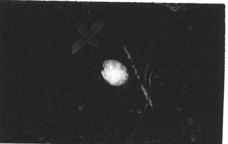
MYSTERY EGG - Egg found in flower bed in fenced yard in Raeford poses mystery for homeowner. Yard is completely fenced and there are no chickens in neighborhood. Size of egg can be judged by pen placed beside it.