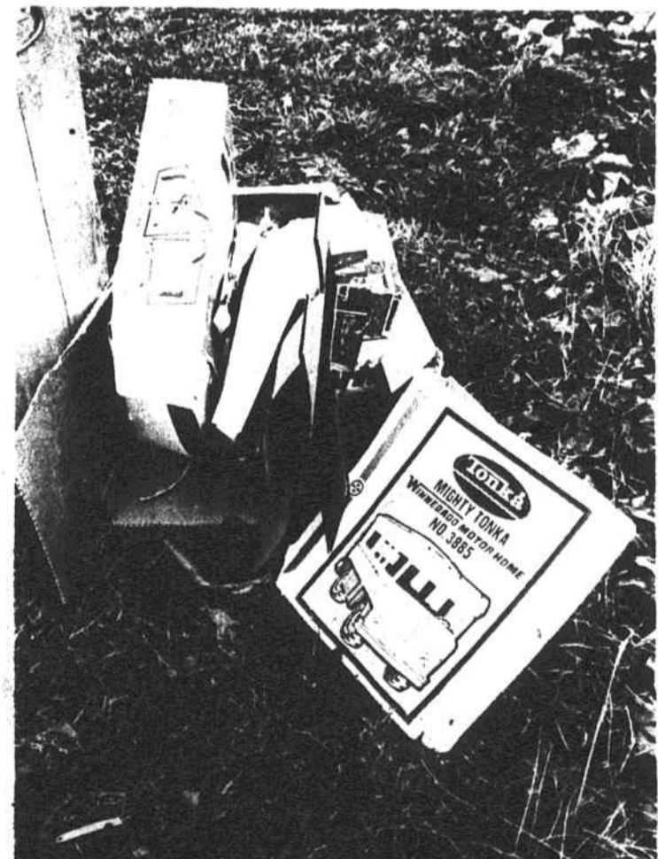
THE AFTER CHRISTMAS STORY - Under tree remnants silently testify Wednesday to the joy spread through at least one local household Christmas morning. Toy boxes, cartons and gift wrap wait beside overflowing trash can for workers to haul them away.