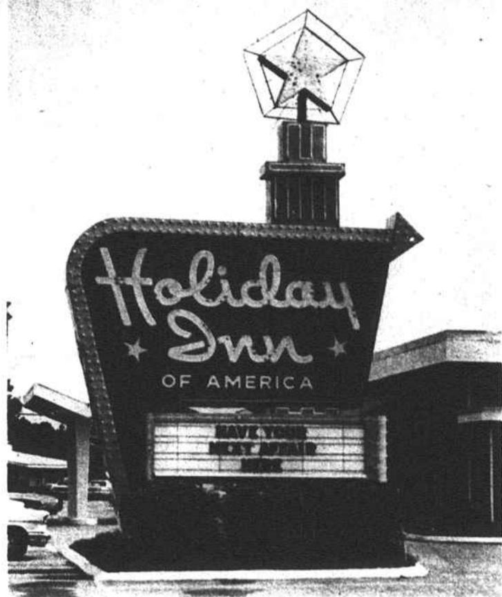
BLOOPER - Signs along the highways provide endless entertainment during vacations. As for this blooper, it could mean public affair or social affair, or family affair.