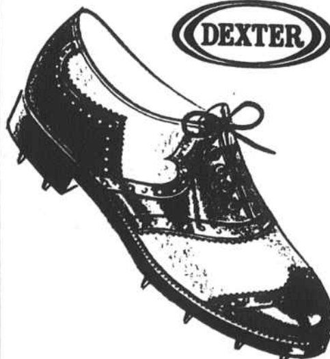
White, Burgundy & White

The only thing Dexter golf shoes lack that big shoes have is the high price ticket. Quality wise, fashion wise, play Dexter.