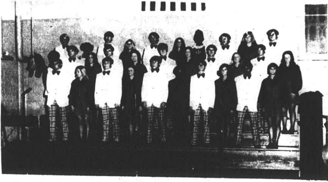
Hoke County High School Chorus