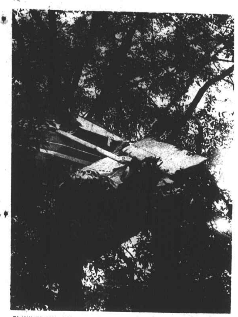
PLANE CRASH - The upside down fuselage and part of a wing of a single engine Cessna 1-50 airplane came to rest in the lower branches of a tree in the backyard of the Bill Gill residence on East Prospect Avenue Saturday at 3:50 p.m. David Hayne, Circle - H Mobile Home Park, student pilot of the plane, was taken to Womack Army Hospital, Ft. Bragg.