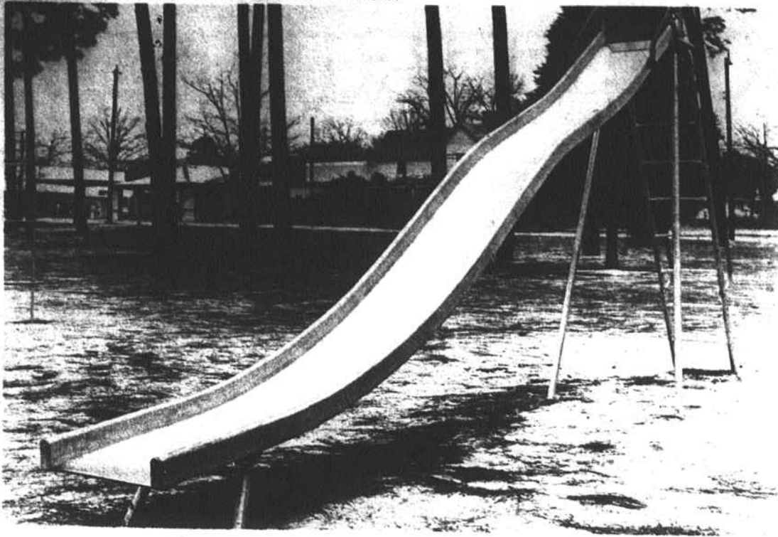
ICY SLIDE -- Snow clung briefly to the icy playground slide, promising a cold ride to anyone who dared to try it.