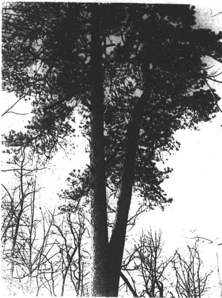
A TREE GROWS-The loblolly pine recently discovered at Drowning Creek almost appears to be two trees, towering to a height of 110 feet. The pine is estimated to be about 180 years old.