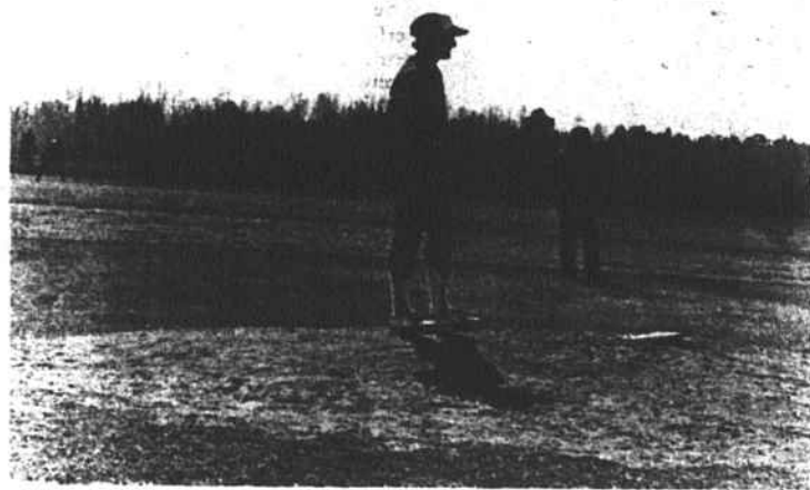
GOING GETS ROUGH - Bucks' pitcher David McNeill pauses to reflect as time is called before going into the extra inning against Pembroke March 7. Hoke lost by one run.