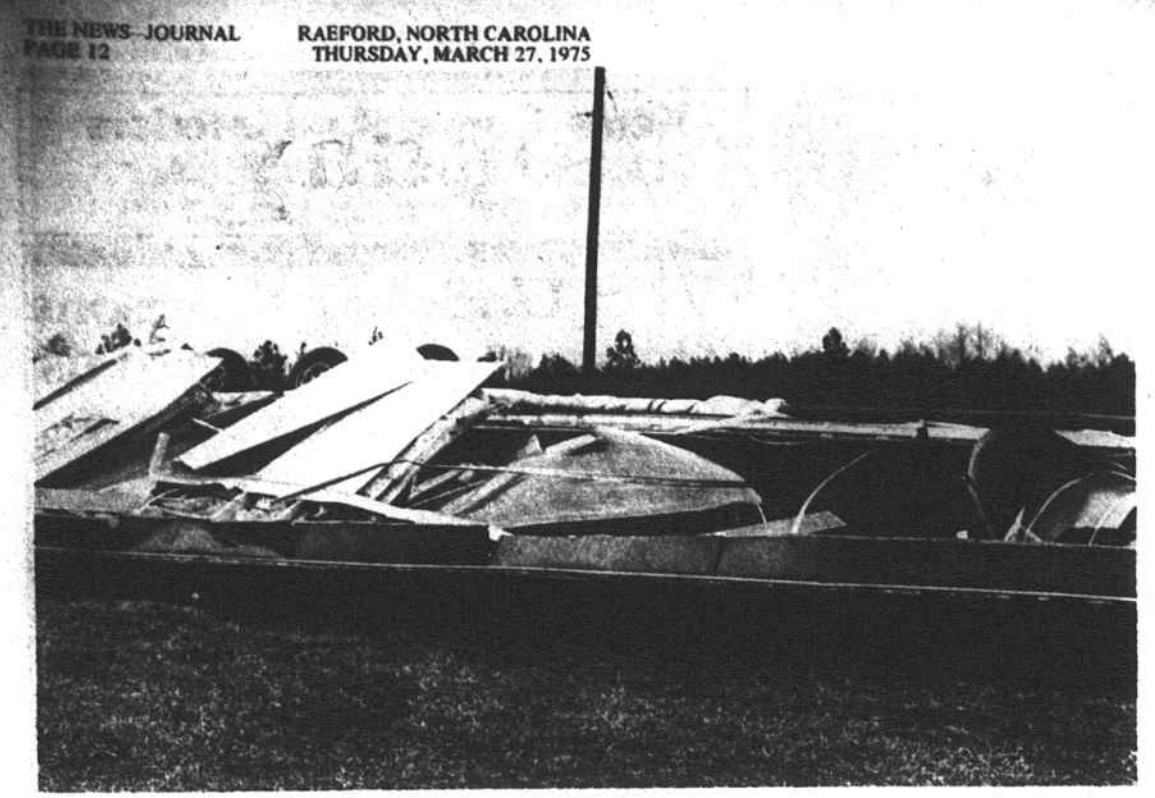
FLIPPED - A mobile home in West Hoke is overturned by the tornado that touched down in a trailer park, smashing two other