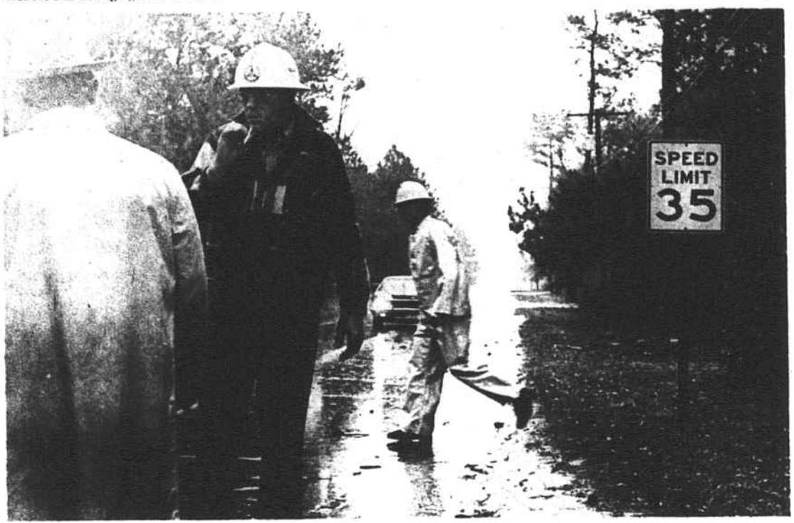
REPAIR - CP&L workers remove downed power lines from North Fulton Street.