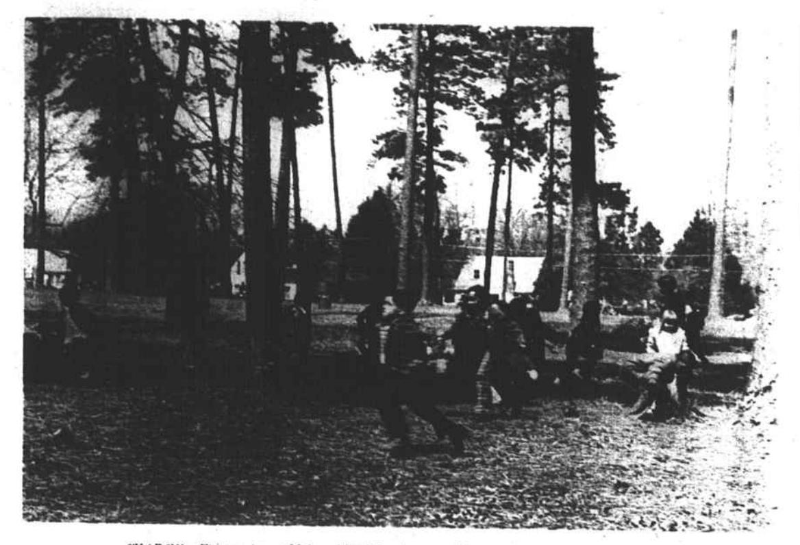
CHARGE - First graders at McLauchlin School scattered last week to begin an Easter egg hunt.