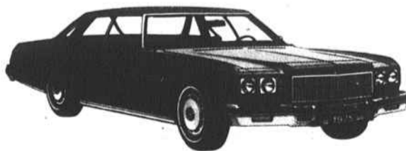
CAPRICE CLASSIC SPORT SEDAN