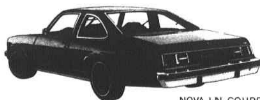
NOVA LN COUPE

Test drive a new Chevrolet and you'll appreciate its good handling, comfort, smart interior and convenient available options. What's more, there's the new Efficiency System designed to heighten the pleasure and lower the cost of driving. Drop by soon and give a Chevrolet a road test. You'll like our wide selection to meet all needs, all tastes, in all sizes.