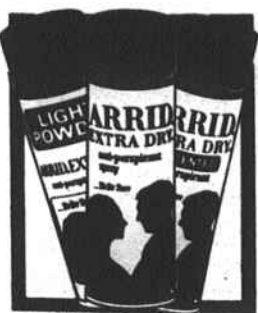
Arrid 6 Oz.

It takes value as well as low price to make a bargain and we are loaded with values! Come and save with us . . . nothing is priced over $5!