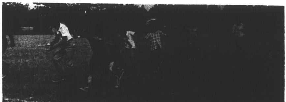
EGG-ACTING - Second graders concentrate on keeping their eggs in their spoons as they compete in the West Hoke field day.