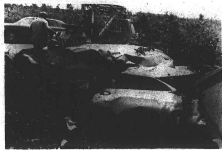
WRECK - Traffic on Vass Road was blocked for an hour Tuesday morning as workers removed a one-car wreck from dense underbrush about one half mile north of the Vass Bridge.

Each school unit must prepare and submit to the State Board of Education its long-range plan, biennial plan, and annual application for State/Federal Aid as a basis for the State Board to allocate funds to local education agencies for occupational education. The long-range plan must be updated every 5 years and biennial plans every two years.