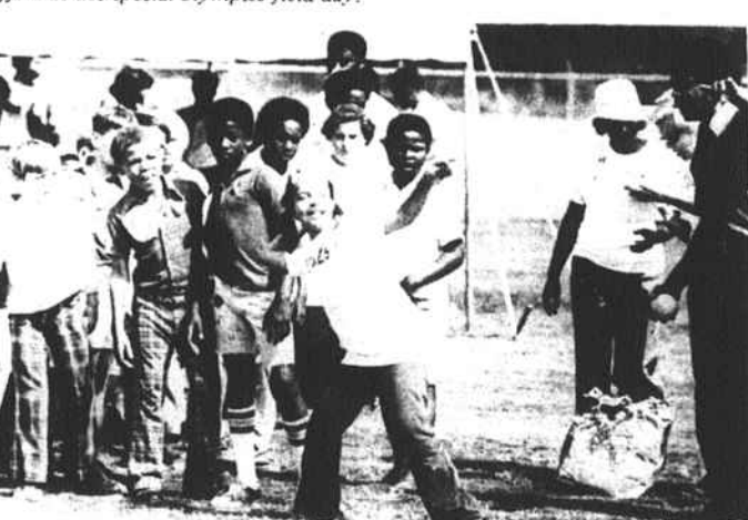
TOSS . . . . a softball during the special olympics field day last week.