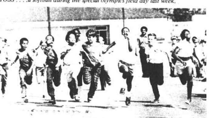
SWIFTLY - Youngsters race toward the finish line in the 100 yard dash during the exceptional classes field day last week