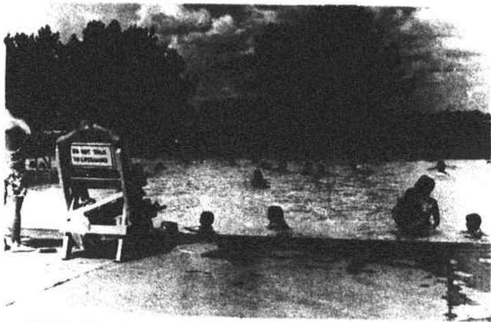
SUMMER COOLER - Members take advantage of a hot day for a cool dip in the Swim Association pool.