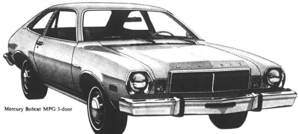
Mercury Bobcat MPG 3-door

*Base sticker prices, excluding title, taxes and destination charges. Dealer prep. extra on Bobcat, Fiat and VW and may alter comparison in some areas. Bobcat's price includes optional WSW tires and bumper guards. Competitors' mileage based on EPA Buyer's Guide.