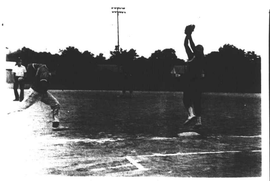
NOT CLOSE - this is some of the action that took place in the first round of the District Five tournament Monday night. The batter from Currie's of Red Springs was out, but they beat Kennerty's Cleaners 7-2.