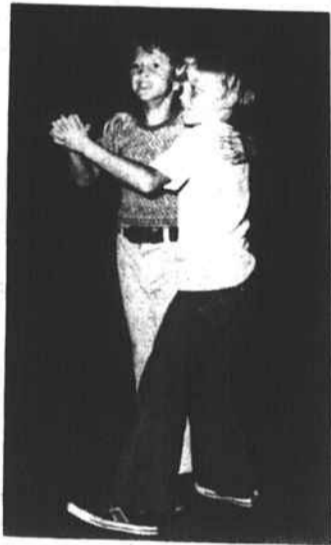
"YOU'RE LEADING, AGAIN" —These two unidentified fellows got right into the spirit of things at the street dance and danced away.