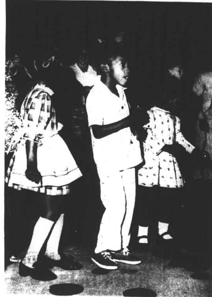
DANCE BEAT—These little ones, getting a treat from an early bedtime, snapped fingers and kept time with the music of Shade, Fayetteville group, who entertained at the Friday night street dance.